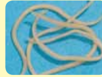
Typical roundworms in this case Toxocara canis

Please ask us to advise you on the most effective worm and flea control regime for your pet – contact us today for further information!