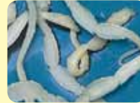
Tapeworm segments e.g. Taenia taeniaeformis