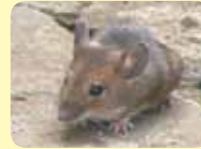
Both small rodents and fleas act as intermediate hosts for tapeworms.