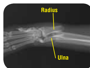
Radiograph of a dog with a fractured forelimb involving both radius and ulna bones.