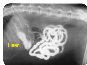
Abdominal radiograph of a cat. Barium outlines the stomach and intestines